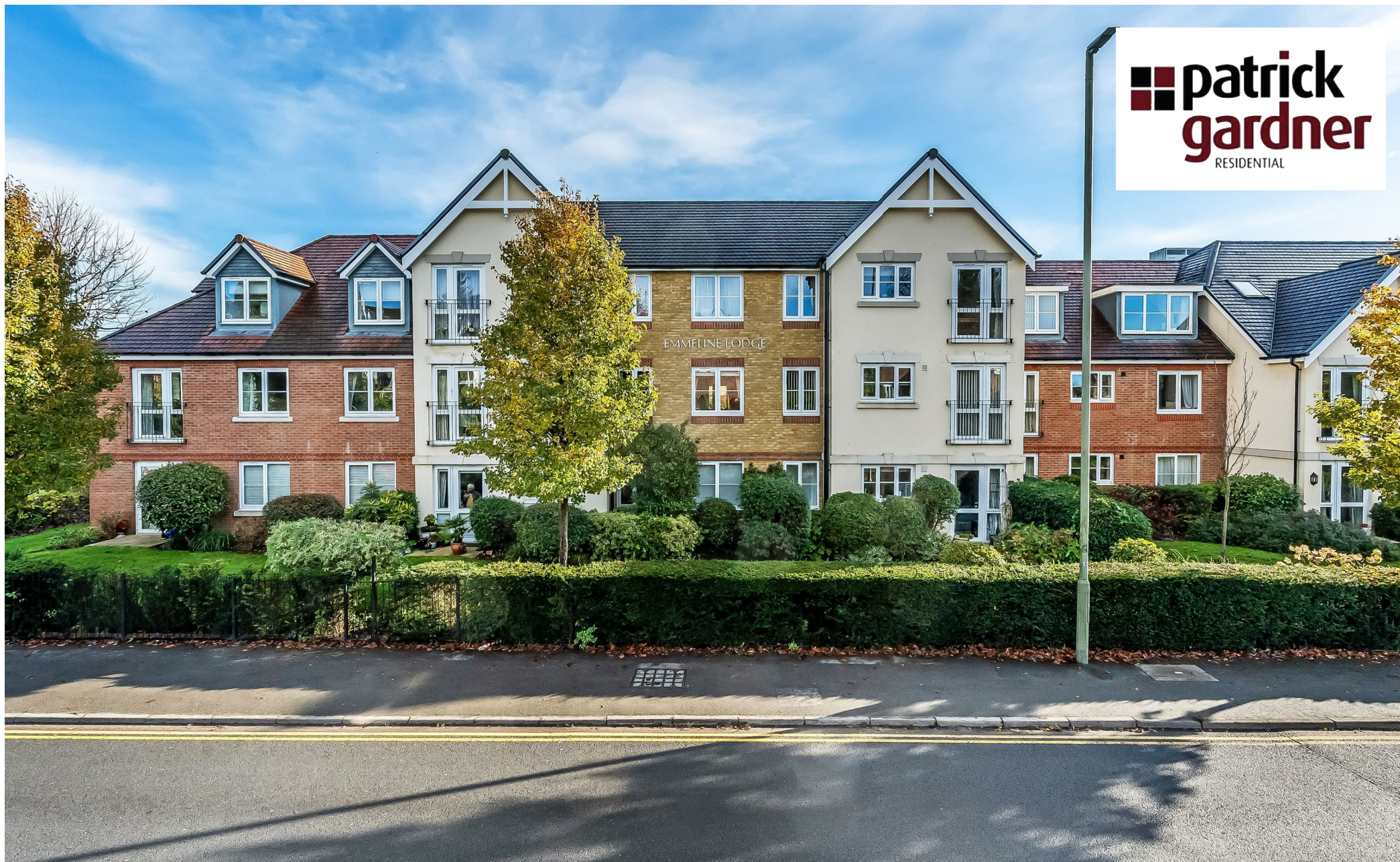
Flat 6 Emmeline Lodge, 27 Kingston Avenue, Leatherhead, KT22 7FU